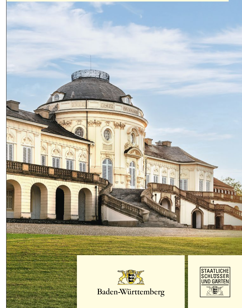
IMAGE CREDIT SSG/MLMZ: cover photo, 2, 4 Günther Bayer/1 Achim Menck; 3 Nina Schubert; 5 Autor unbekannt // Design concept: www.jungkommunikation.de

SSG_MONTELY_199_StuttgartSol_CG_01_23-24