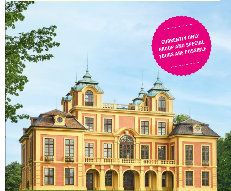
IMAGE CREDIT SSG/MLMZ: cover photo, 1, 2, 4, 5, 6 Günther Bayerl; 3 Nico Schubert // Design concept: www.lingkommunikation.de

CURRENTLY ONLY GROUP AND SPECIAL TOURS ARE POSSIBLE