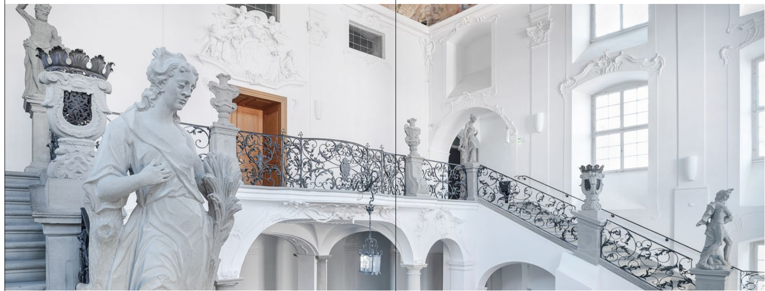
👑 The palace's terrace and teahouse are situated above Lake Constance and offer spectacular views

Balthasar Neumann created the designs for both the Palace Church