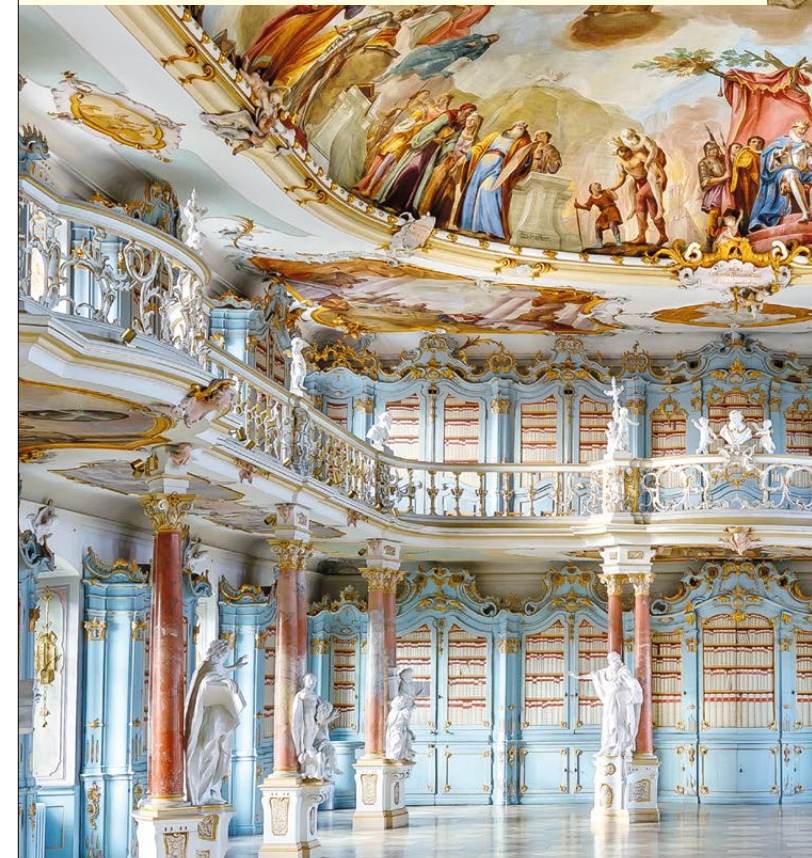
IMAGE CREDIT: SSG/TLMZ; cover photo Alfred Weiss Fotografie; 1 Nels Schuberl; 2 Günther Bayerl; 3 Tom Kohlhauser; 4 Adhim Meinde // Design concept: www.jungkommunikation.de