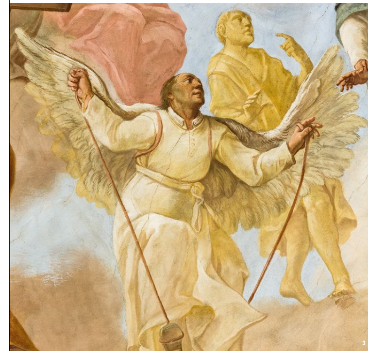
🏰 Schussenried's most famous son: Father Caspar Mohr, depicted in the library ceiling fresco; he was nearly a pioneer of aviation

The best-known image from the fresco shows the enterprising father, Caspar Mohr. In the 17th century, he constructed a feathered flying machine, almost becoming the aviation pioneer of Upper Swabia, generations before the Zeppelin airship was invented.