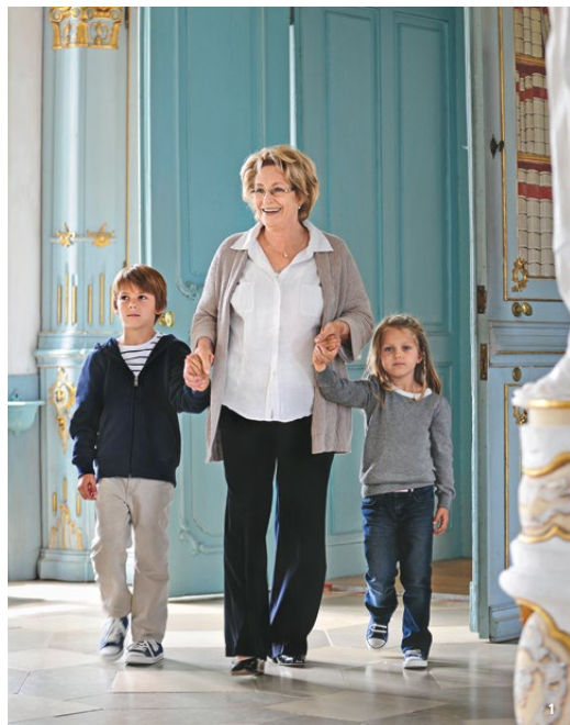
🏰 Right: A heady mix of shapes and colors: The library at Schussenried Monastery is a Rococo masterpiece