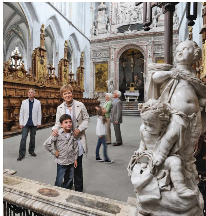
🏰👑 The Gothic cathedral is adorned with shimmering alabaster dating back to the 18th century

🏰👑 Right: The abbot's parlor in the prelatore