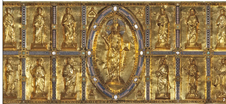
🏰 Dating back 900 years, this altar frontal is a unique witness to the Middle Ages