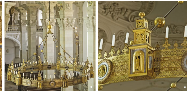
🏰 The precious Romanesque wheel chandelier with one of the gateways to “New Jerusalem”

An exquisite building, with a bright but august atmosphere is what strikes you when you first enter the Baroque Church of St. Nicholas. It accommodates two exceptional works of art: the richly decorated, gold-plated antependium that adorns the altar table, and the Romanesque wheel chandelier —two outstanding pieces produced by European goldsmiths. The Romanesque antependium is one of a