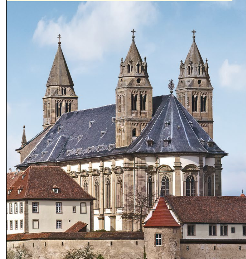
IMAGE CREDIT SSG/LMZ: cover photo, 1, 2, 3, 4, Armin Weischer; 5 Jürgen Waller // Design concept: www.jungkommunikation.de

SSG_MONTEF_01_Schwaebisch-Hall_GBR_01_23-24