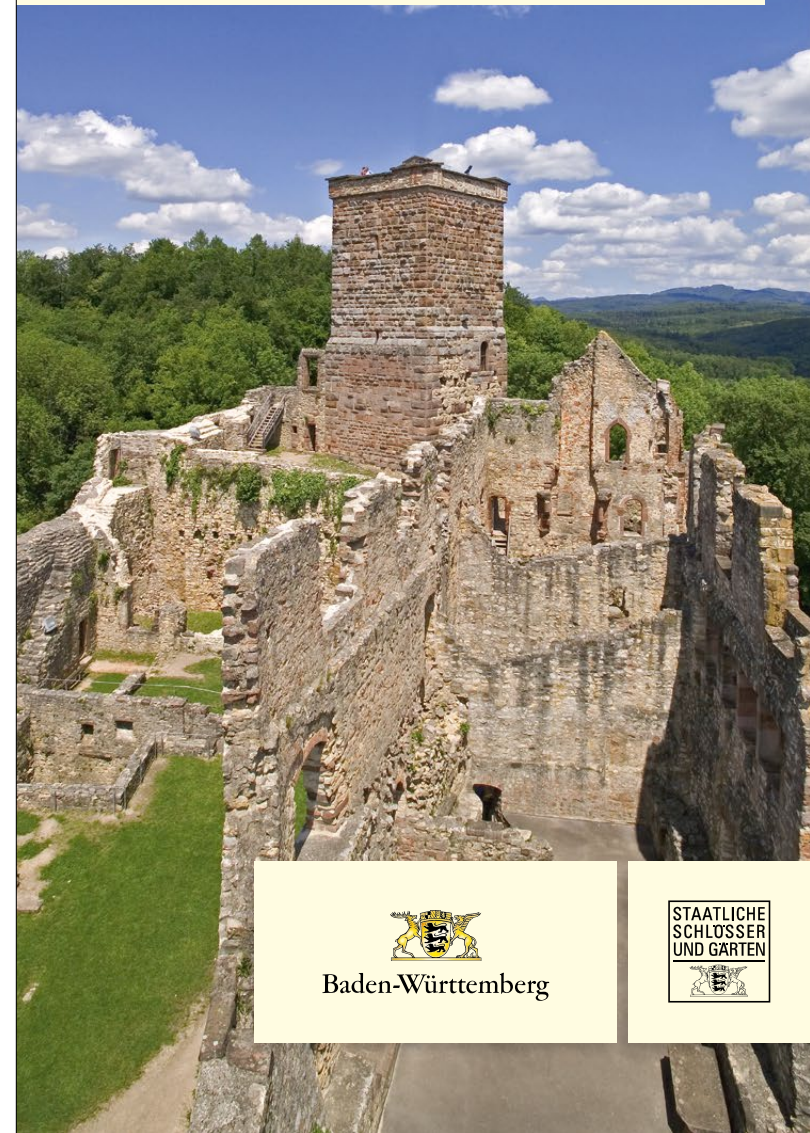
Design concept: www.lingcommunication.de

SSG_MONFEL_123_Lörrach-Haagen_GB_01_23-24