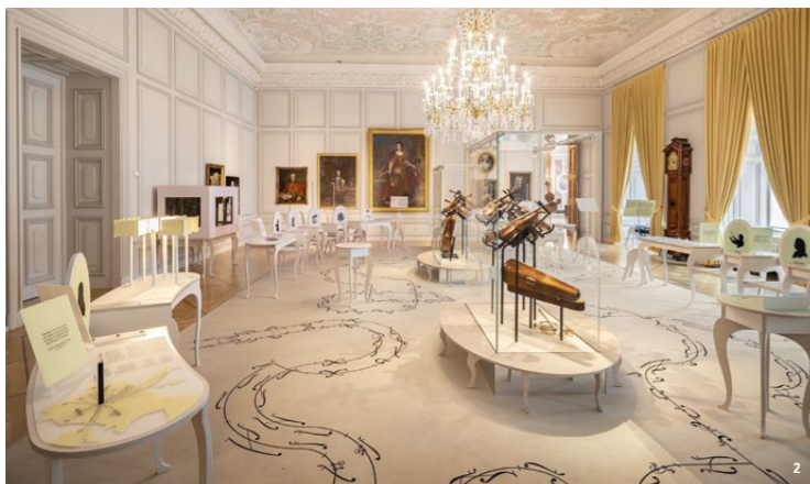
👑 Courtly music virtual experience in the Guard Hall

The Baroque-style palace consists of five wings. The elongated facades are typically three stories high, the four-story pavilions inserted into the structure relieve the strictness of the right-angled architecture.