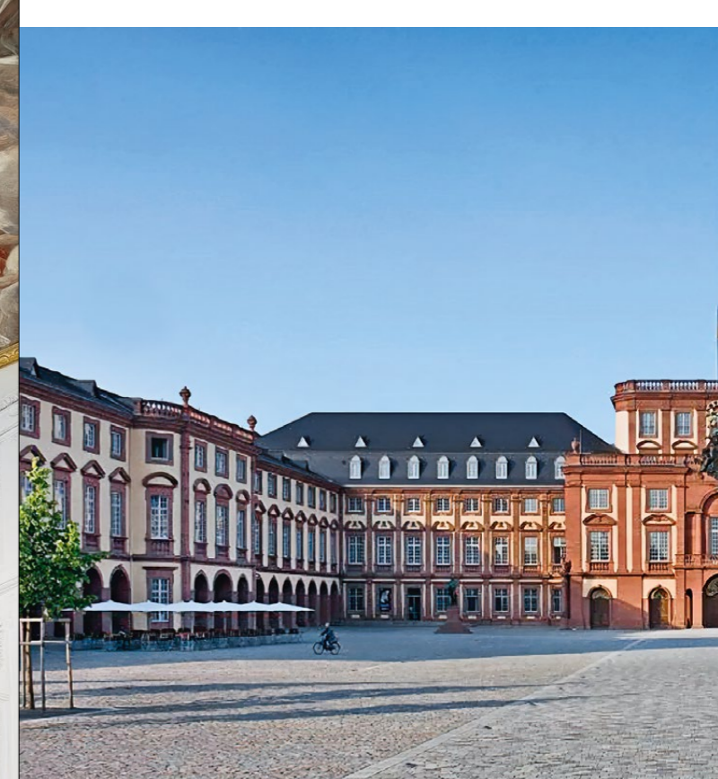
Mannheim Baroque Palace with main courtyard and show facade