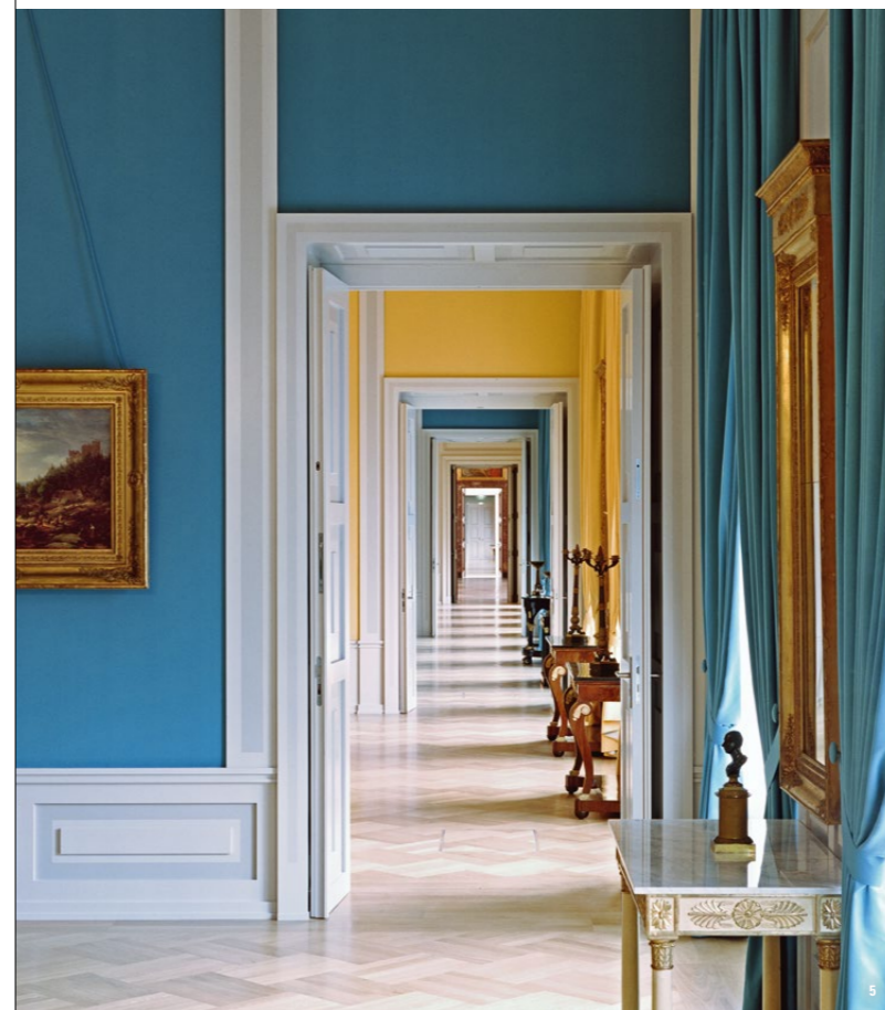
👑 The main rooms are laid out in a long row covering the entire length of the main floor