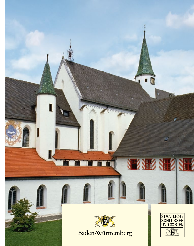
IMAGE CREDIT SSG/ILMZ: cover photo Sven Gieremann; 1, 4 Dieter Jäger; 2 Joachim Feix; 3 Author unknown; // Design concept: www.jungkommunikation.de